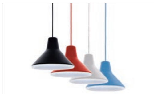
D68 - screw connection E27

Suspension accessory 1D680S000002 white 1D680S000001 black 1D680S000023 light blue 1D680S000007 red