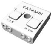
Dimmer Radio-frequenza, 85-240V